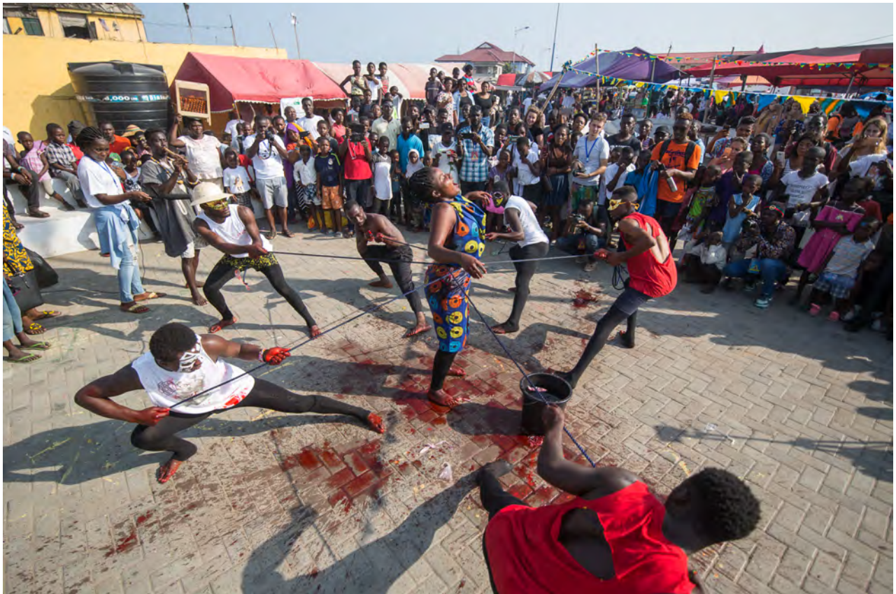
Members of Act for Change perform WATA WOMAN at last year's festival.

Last year, more than 15,000 people came out to CHALE WOTE.